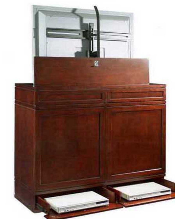
FRONT VIEW (SHOWN WITH OPEN DRAWER)