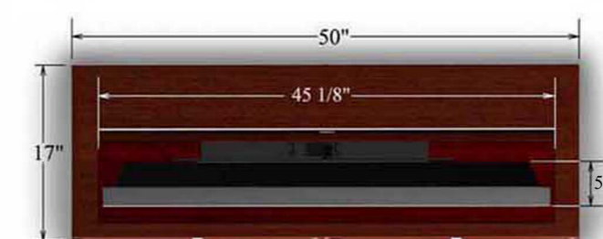
TOP VIEW (open)