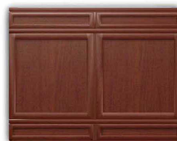
FRONT VIEW (closed)