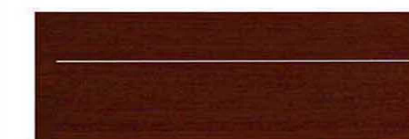
TOP VIEW (closed)

Infrared relay system provides a window from your handheld remotes to your TV and audio components even though they are concealed inside the cabinet. No programming required!