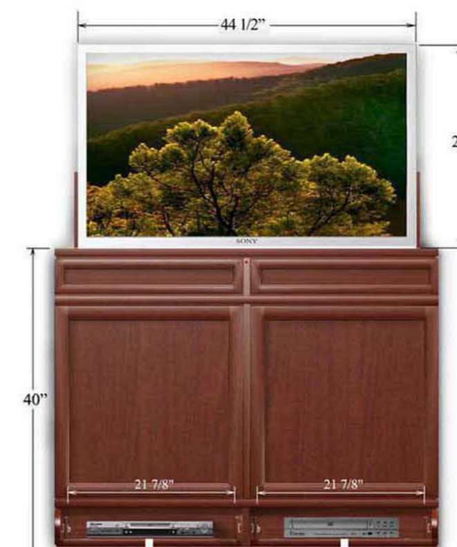
FRONT VIEW (open)